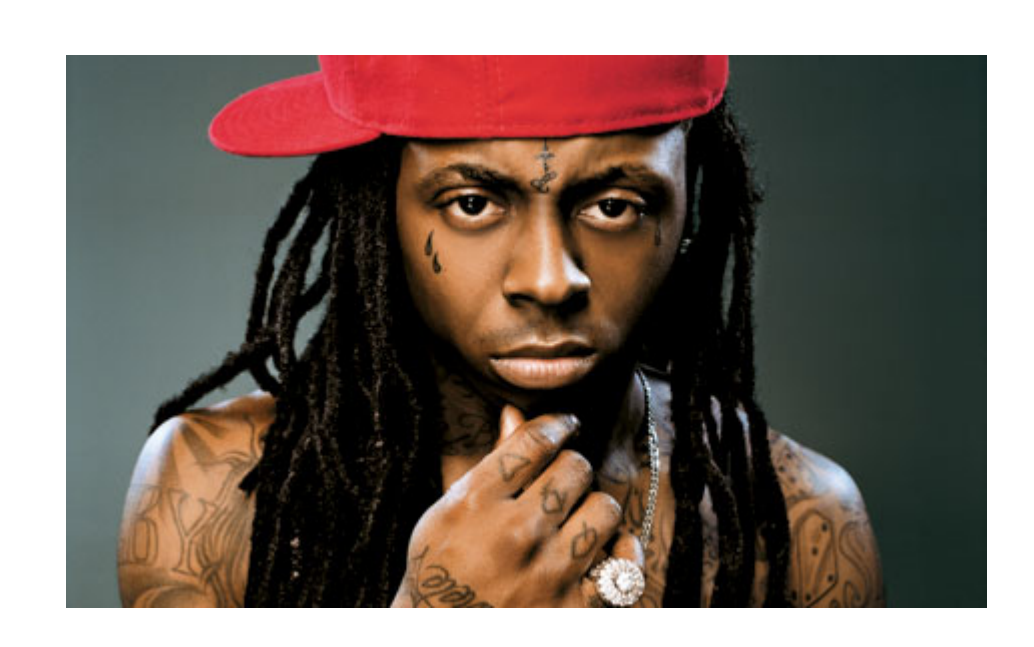
"I like being misunderstood."