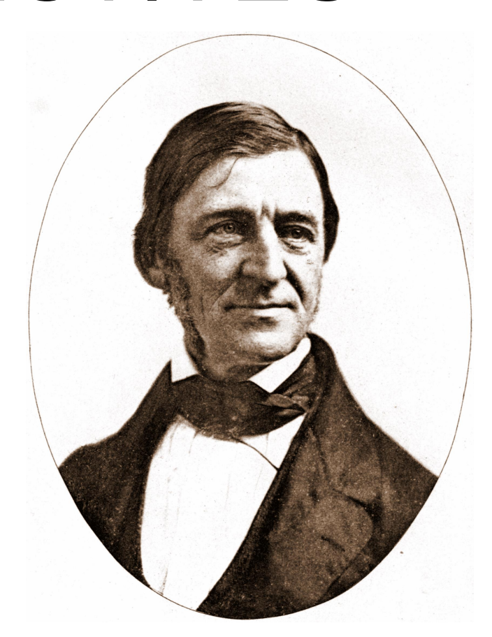
"To be great is to be misunderstood."